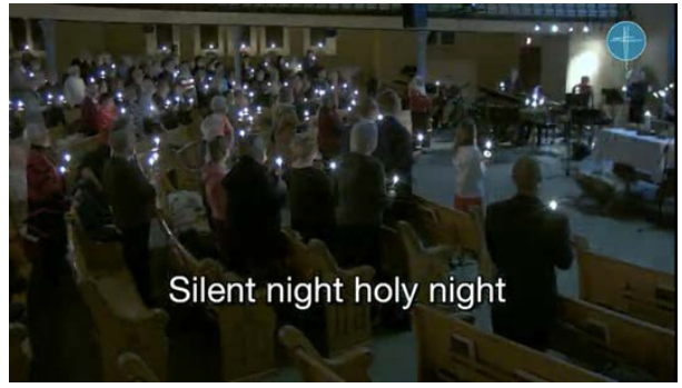
Silent night holy night